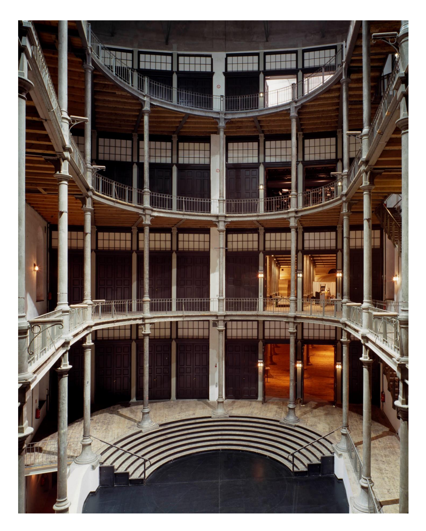
Studio Building of the Academy of Fine Arts Vienna Prospekthof EG

Area: 385 m<sup>2</sup>, 1st Gallery: 245 m<sup>2</sup>